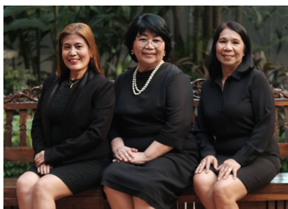
Financial Management Section