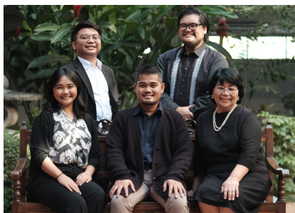
Program Development and Management Section