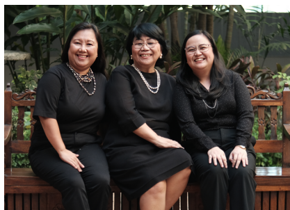
Membership Services Section and Social Science Ethics Review Board