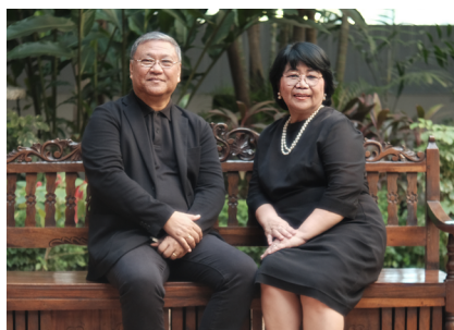
Center Management and Administrative Section